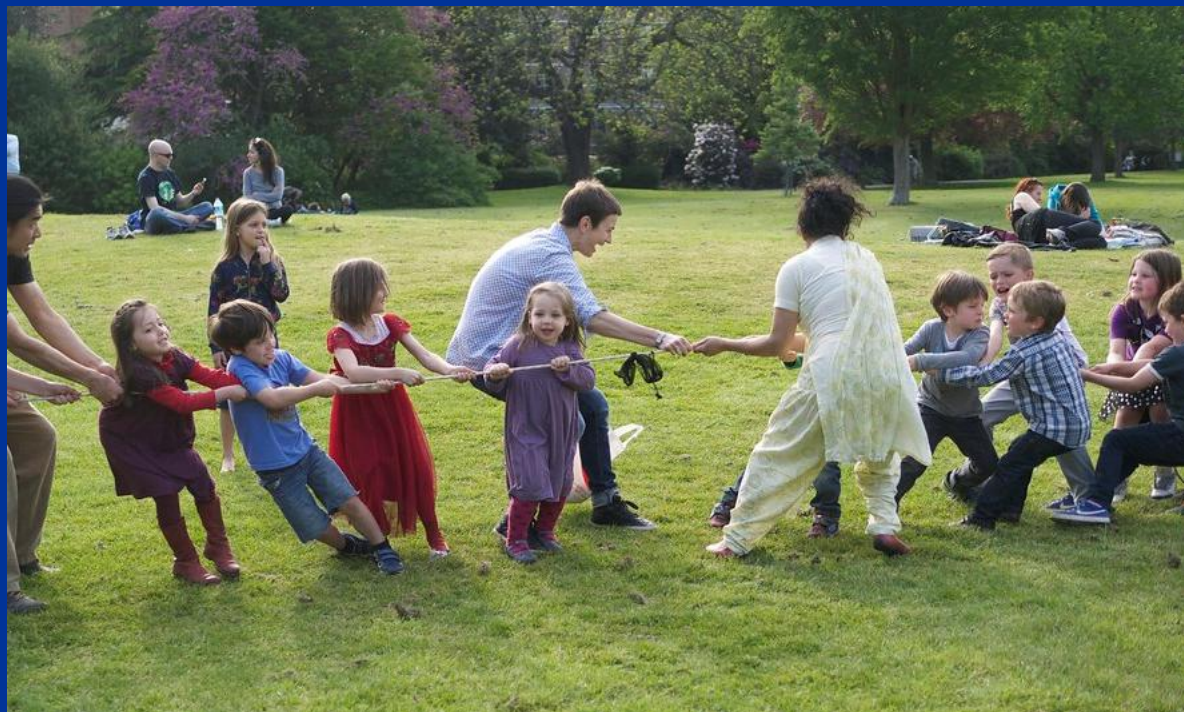
"tug of warring" by pedroreyna —CC BY 2.0.